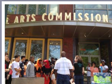
REGIONAL ARTS COMMISSION OFFICE