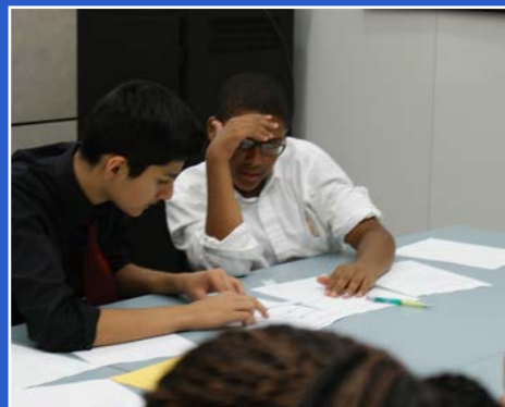
FUTURE CRIME LAB SCIENTISTS?