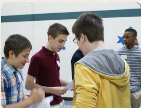
Icebreaker activities are an excellent way to meet new classmates and friends!