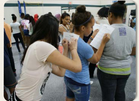
Working together on icebreaker activities