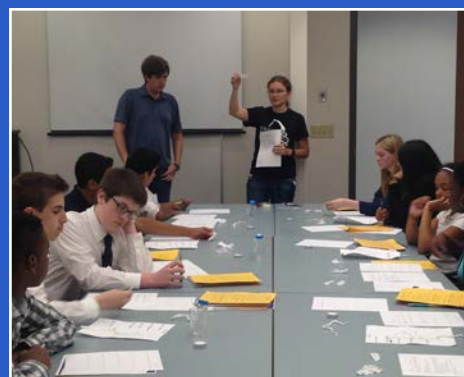
USING FORENSICS TO SOLVE A CRIME