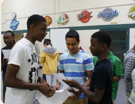
Incoming freshmen gathering information from their new classmates