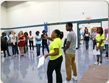
CSMB sophomores leading ice breaker activities