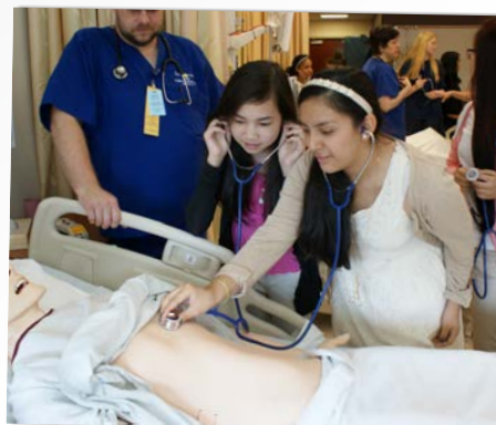
GOLDFARB SCHOOL OF NURSING