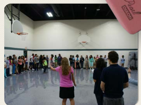
Sophomores facilitating the "this or that" icebreaker