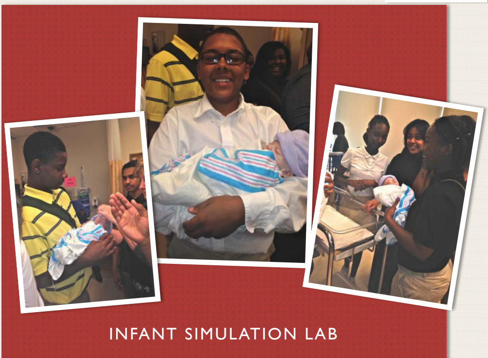
INFANT SIMULATION LAB