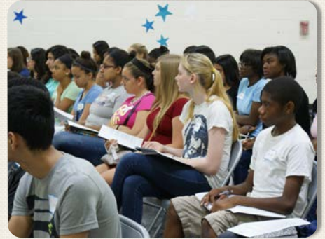
Students listening attentively