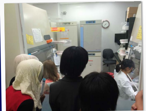
ACTIVITIES AT WASH - U SCHOOL OF MEDICINE