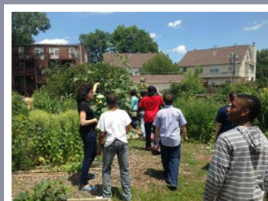
TOURING THE COMMUNITY GARDEN