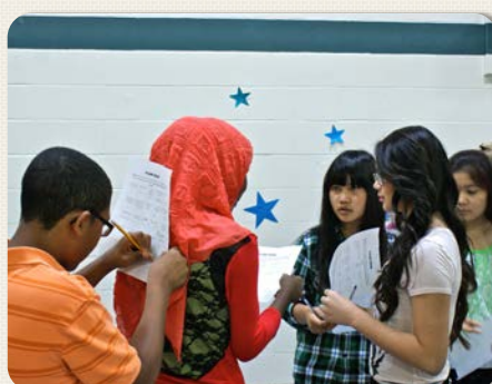
Getting to know new classmates and make new friends!