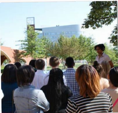
CSMB AT SLU MEDICAL SCHOOL

We are proud to introduce the Collegiate School of Medicine and Bioscience's second class, the class of 2018. They are an amazing cohort of academic scholars and solid citizens. Beyond the classroom, they are gifted artistically, athletically, musically, and demonstrate compassion towards those less fortunate. There is no doubt, these young people will achieve greatness!