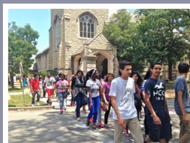
WALKING SKINKER BLVD.