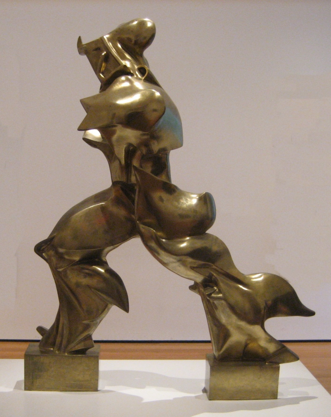
Umberto Boccioni, Unique Form of Continuity in Space 1913, bronze