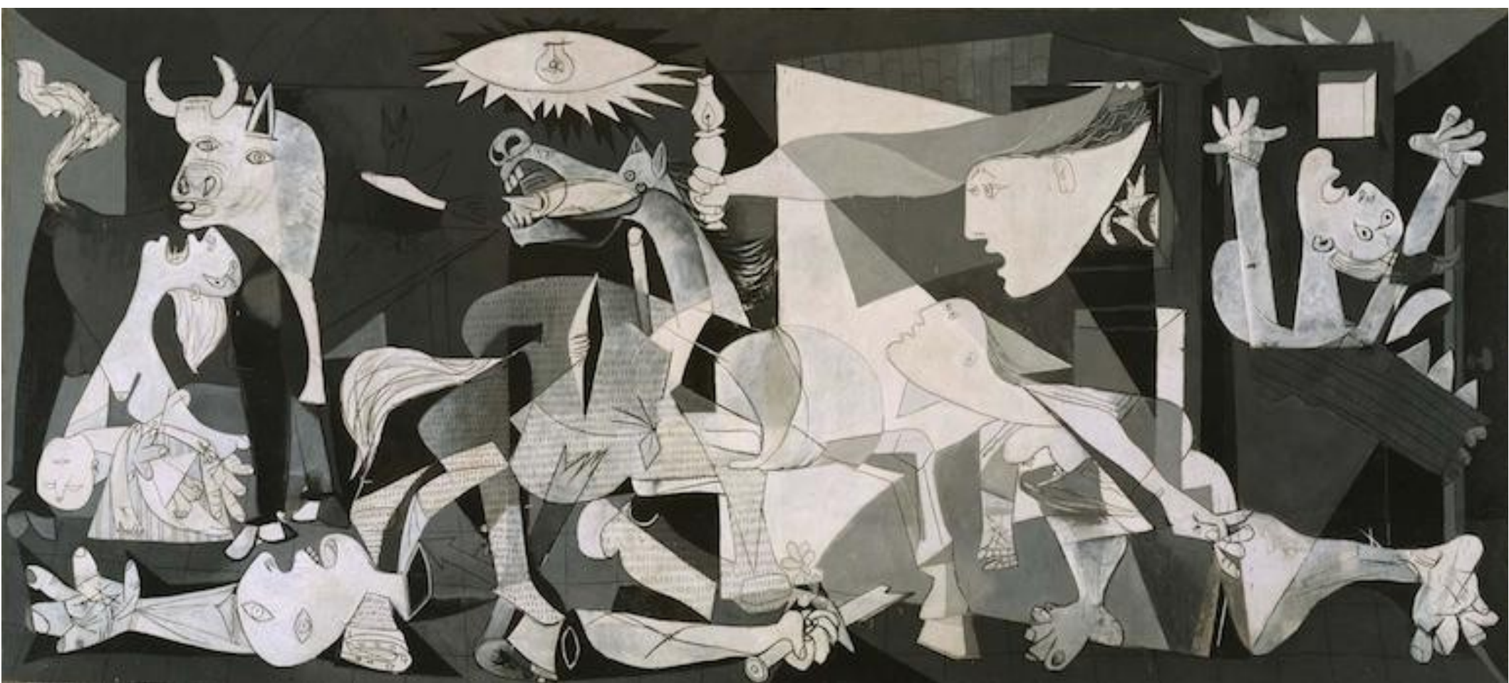
Pablo Picasso, Guernica, 1937, oil on canvas