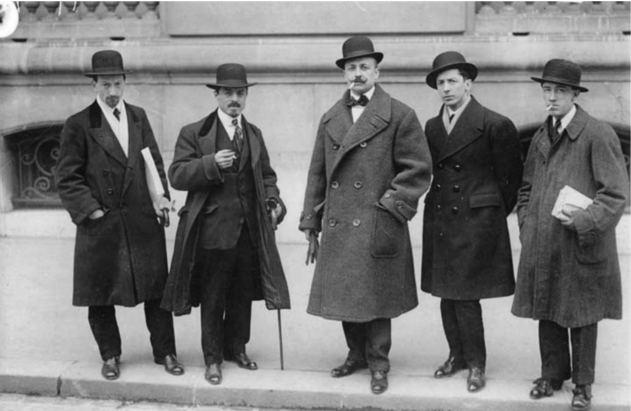
Luigi Russolo, Carlo Carrà, Filippo Tommaso Marinetti, Umberto Boccioni and Gino Severini in front of Le Figaro, Paris, February 9, 1912