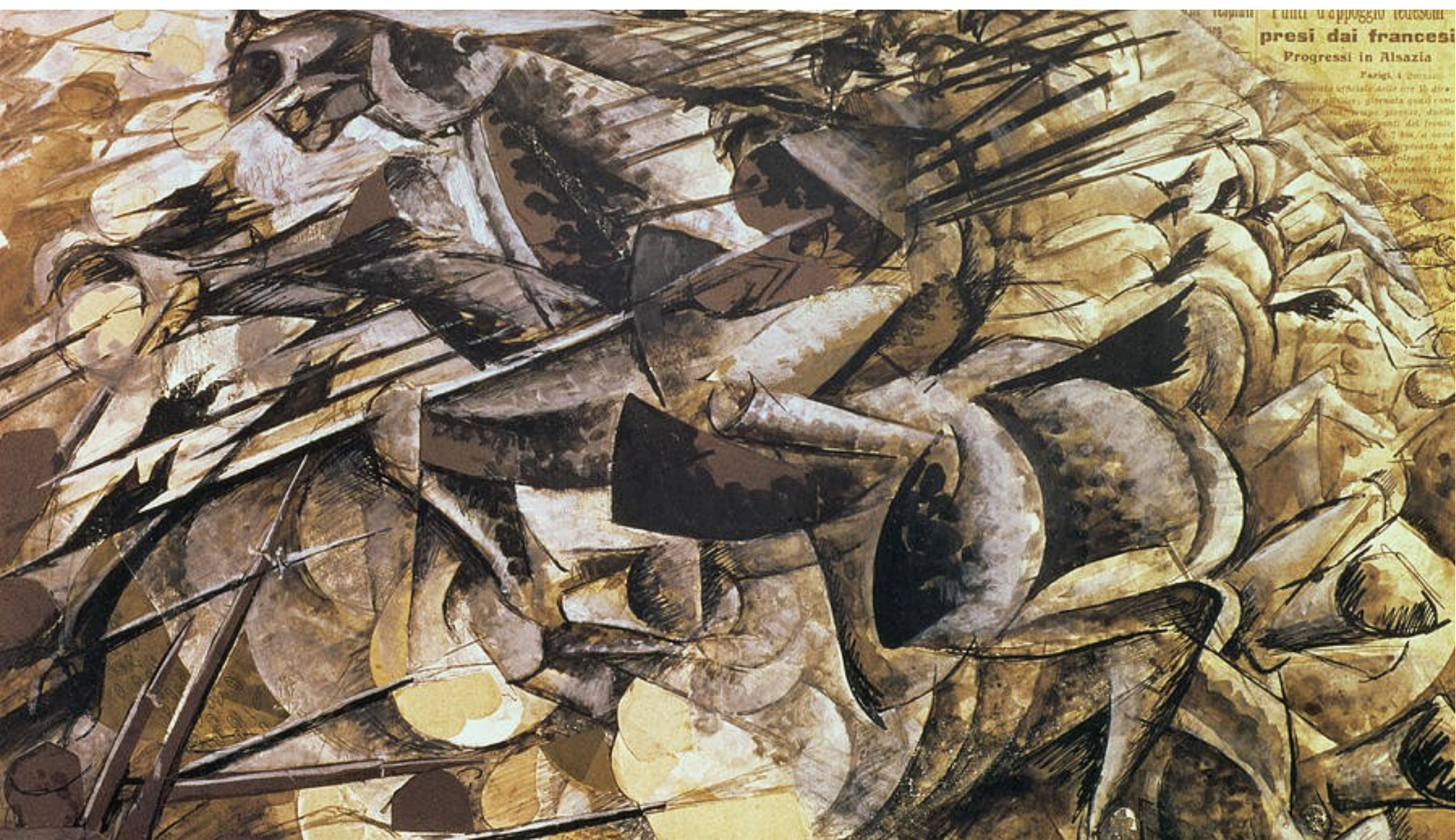
“The Charge of the Lancers”, Umberto Boccioni, 1915, oil on canvas