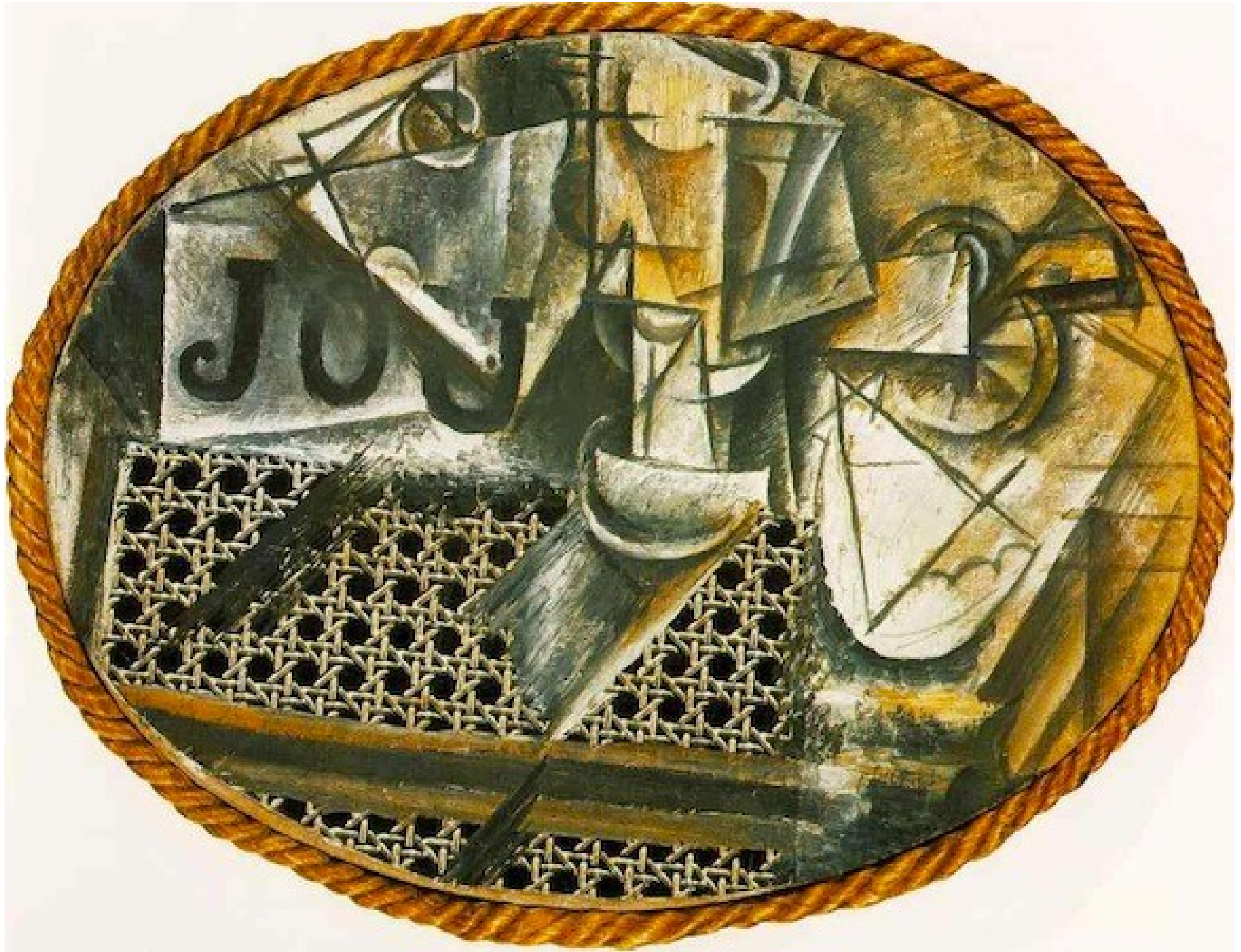
Pablo Picasso, Still Life with Chair-Caning, 1912, oil and oil cloth on canvas