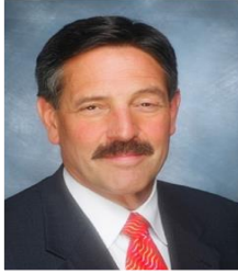
President and CEO