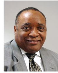
Comprehensive Long-Range Planning Chair