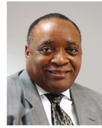
Comprehensive Long-Range Planning Chair