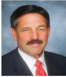
President and CEO