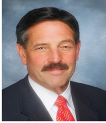
President and CEO