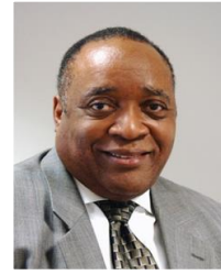
Comprehensive Long-Range Planning Chair