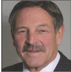
President and CEO