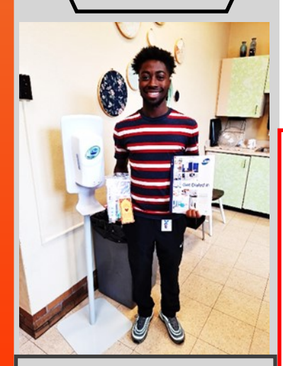
#thanksptotoday for helping our teachers and staff stay Dialed In

Honesty- means speaking and acting with truthfulness in all situations.