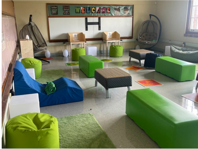
Check out our new RenU Space!