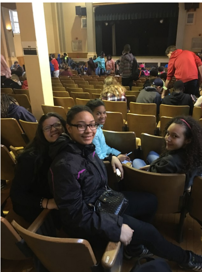
Students at McKinley High School are happy to fill out surveys that will improve their school meals!

Students were excited to come through the breakfast or lunch line to determine if it was their lucky day. If students had a "lucky tray" they found a sticker under their tray and were able to come up and receive a prize of their choice!