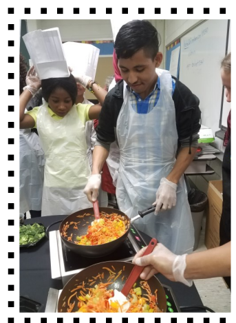
Students at NCNAA trying their hand at sautéing vegetables for the chicken stir fry!