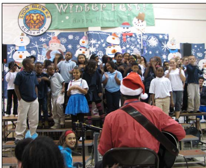
Third Grade takes the stage.