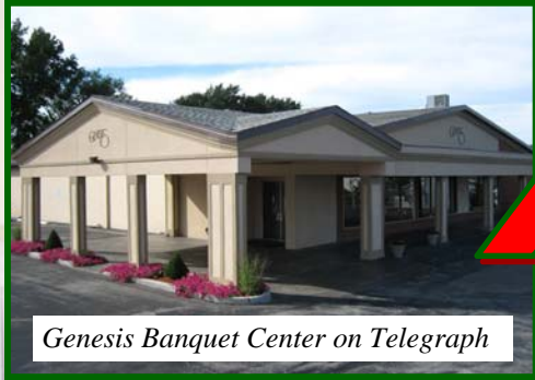
Genesis Banquet Center on Telegraph