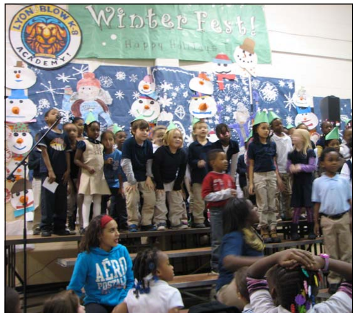
Students from the Kindergarten and First grades were enthusiastic and belted out their songs to an appreciative audience.