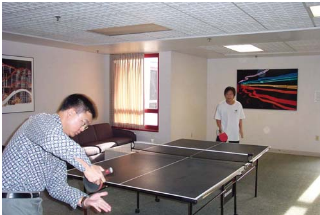
Table tennis, or ping-pong, is an enjoyable sport but it can be highly competitive. Each player tries to outscore his opponent through the use of skill, strength, speed, stamina and strategy. The game is somewhat similar to tennis, where players hit the ball back and forth over a net.

The game is played on a table surface with the use of paddles and a ping-pong ball. The objective in the game is to be the first to score 21 points.