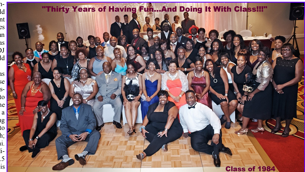
Class of 1984