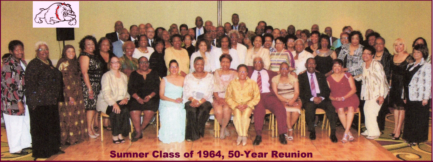
Sumner Class of 1964, 50-Year Reunion