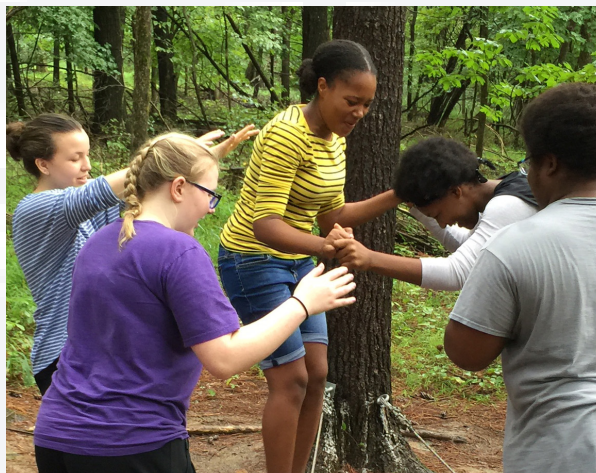
The Freshman Class of 2016 on the Camp Wyman "Low Ropes Course"

The 2016-17 school year is well underway, and CSMB is thriving! Clubs and extra curriculars, sports, and academics are continuing to surpass our expectations, and prove we are an exceptional school. We look forward to the remainder of our first year of full-enrollment.