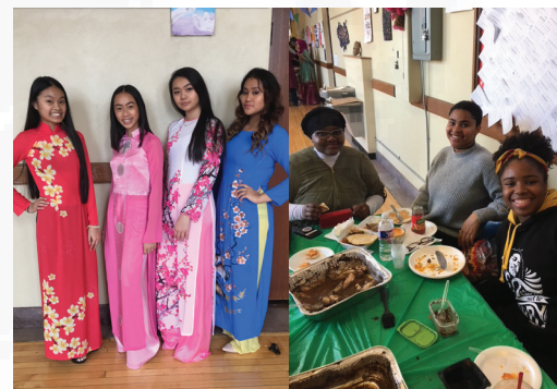
Students represent Vietnam (left) and Jamaica (right) at International Day.