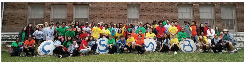
Clockwise from top left: Red group balances their entire team on a tire; green group builds a tower out of milk crates; orange group circles up; the freshman class poses outside Collegiate before their trip.