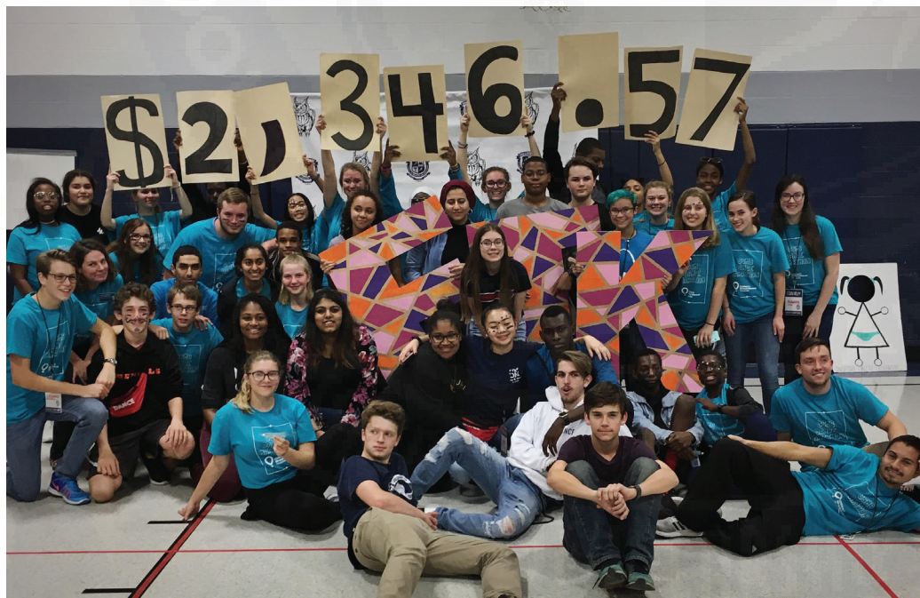
Collegiate students and staff showcase the grand total raised for Children's Miracle Network at the first Collegiate Dance Marathon: $2,346.57. All funds will go to local children's hospitals.

In total, Collegiate students and staff raised over $2,300 benefiting St. Louis Children's Hospital and SSM Health Cardinal Glennon Children's Hospital. Funds will go towards new programs, equipment, and facility renovations to meet the needs of area kids.