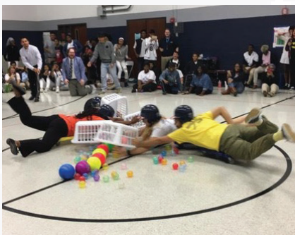
Clockwise from left: Student Council sets up biggest Homecoming Dance yet; students play Giant Jenga; life-sized Hungry Hungry Hippos, staff edition. Eagle Owl House was victorious in House Wars of Spirit Week 2017.