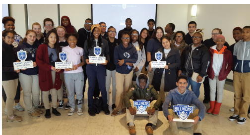
Juniors at SLU's Doisy College of Health Sciences

On October 27th, St. Louis University's Doisy College of Health Sciences hosted the junior class for the second-annual "Collegiate Day @ Doisy." During the field trip, students learned more about the health fields of Physical Therapy, Occupational Therapy, Communication Sciences and Disorders, Nutrition and Dietetics, Investigative & Medical Sciences, Medical Laboratory Science, Magnetic Resonance Imaging, Nuclear Medicine Technology, Radiation Therapy, Health Information Management, and Athletic Training. Throughout the day, students used different healthcare disciplines to follow the case of Jane Billikin.