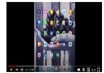
Directions on how to download pre-installed applications