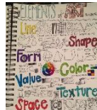
Elements of Art Photo Form