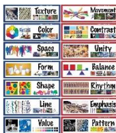
Elements and Principles of Art SWAY