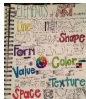
Elements of Art Photo Form