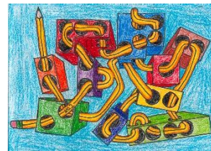
9 Boxes Turn in Form-16