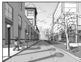
One-Point Perspective Form-17