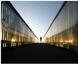
One-Point Perspective SWAY