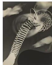
Questions about Man Ray – F18