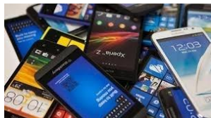
Cell Phone Writing Prompt F-19