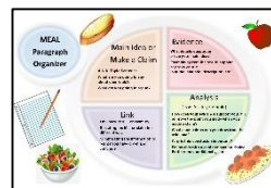
MEAL Format and Rubric

For a clear view of the Format, scroll down. Rubric is linked with the image above.