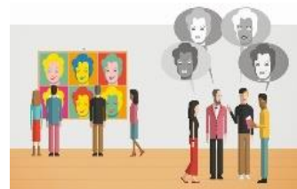
Peer Critique Form