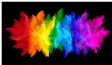
SWAY on the Color Wheel