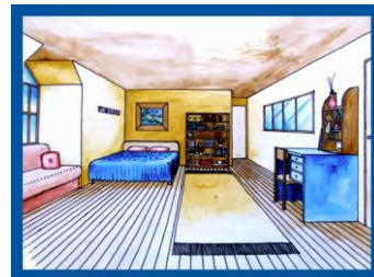
Turn in One Point Perspective Room