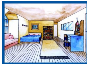
Turn in One Point Perspective Room