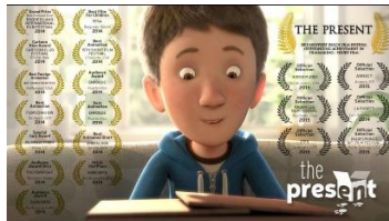
Article “The Artists Behind the Present”