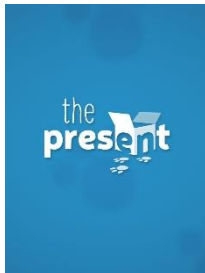
The Present Short Video