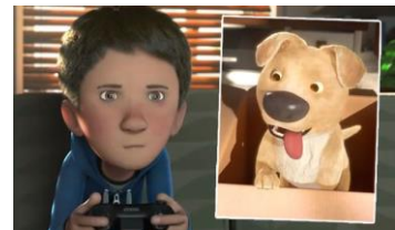
Questions about “The Present”